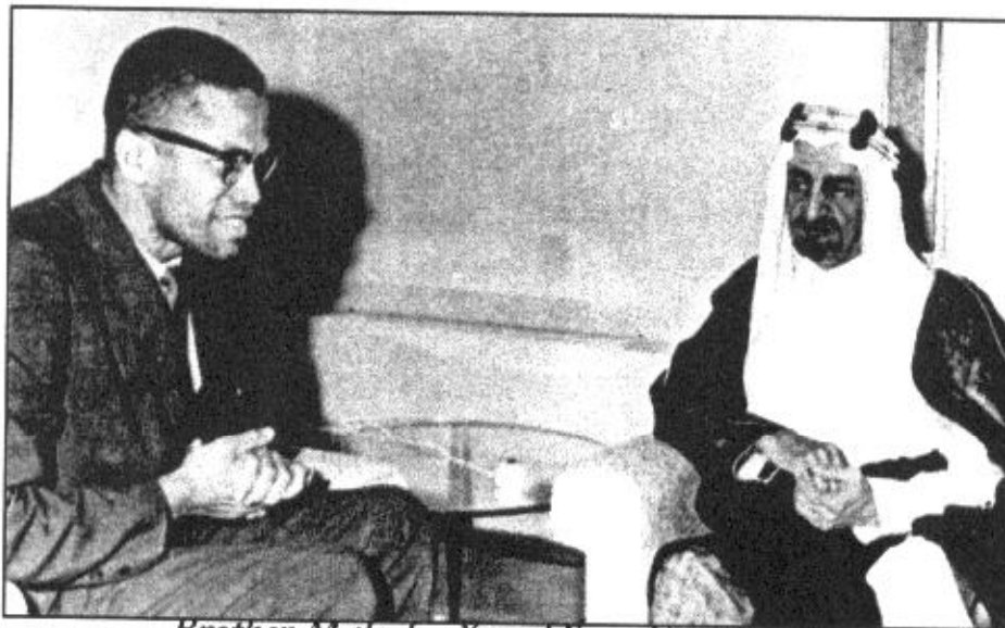
Brother Malcolm X and King Faisal- 1964