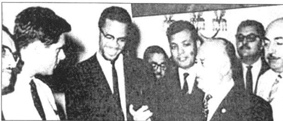
Malcolm X with Palestinian delegation to UN, 1964